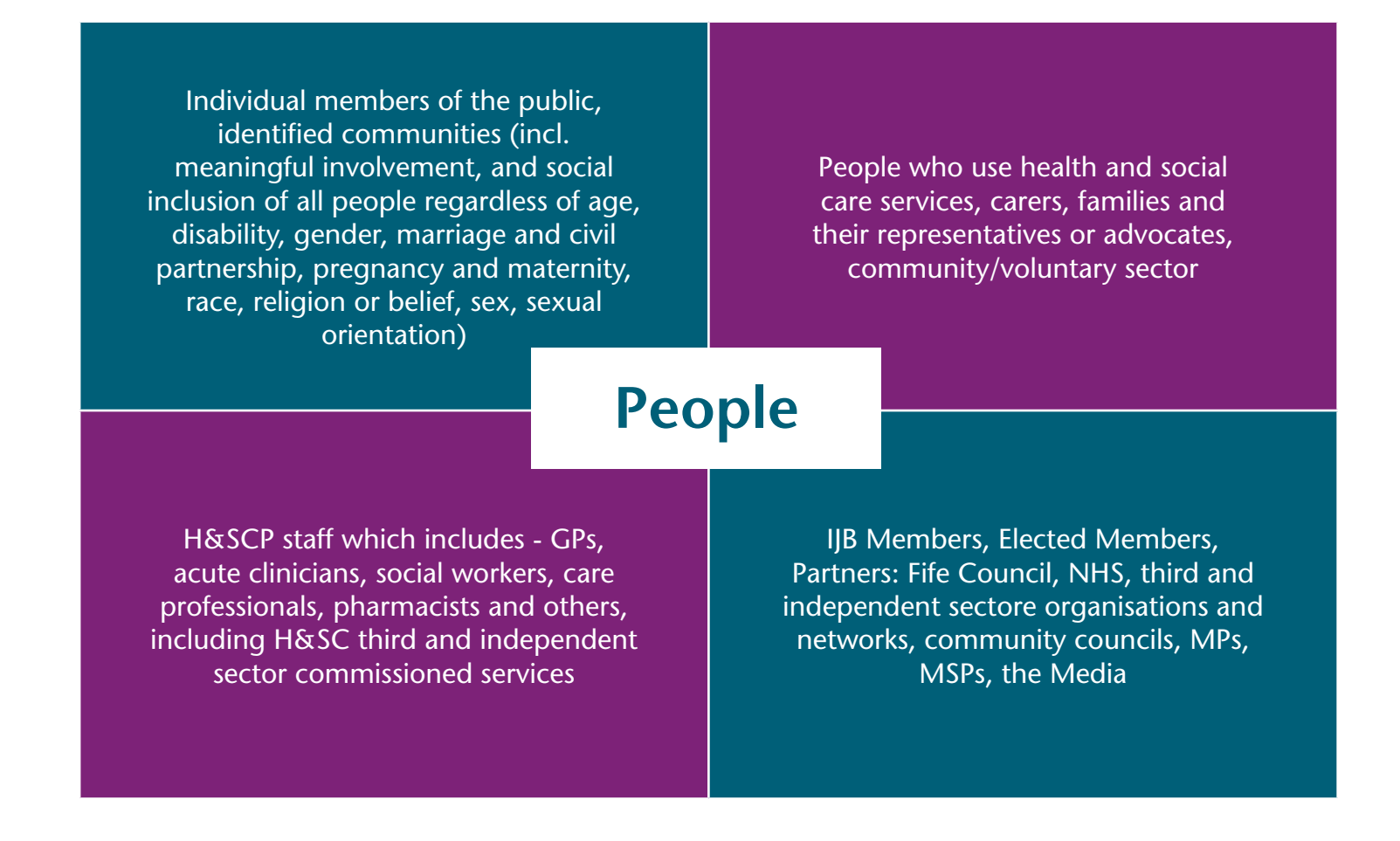
Figure 3: Key Stakeholders